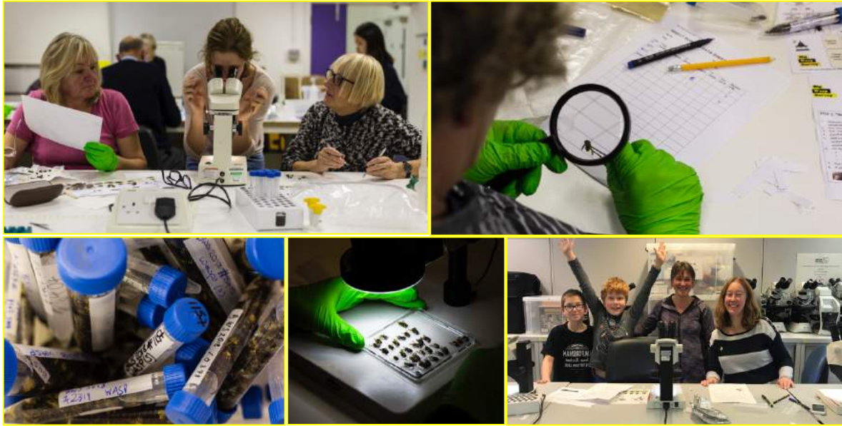
Fig. 3: Big Wasp Survey public insect sorting and identification workshops, 2018