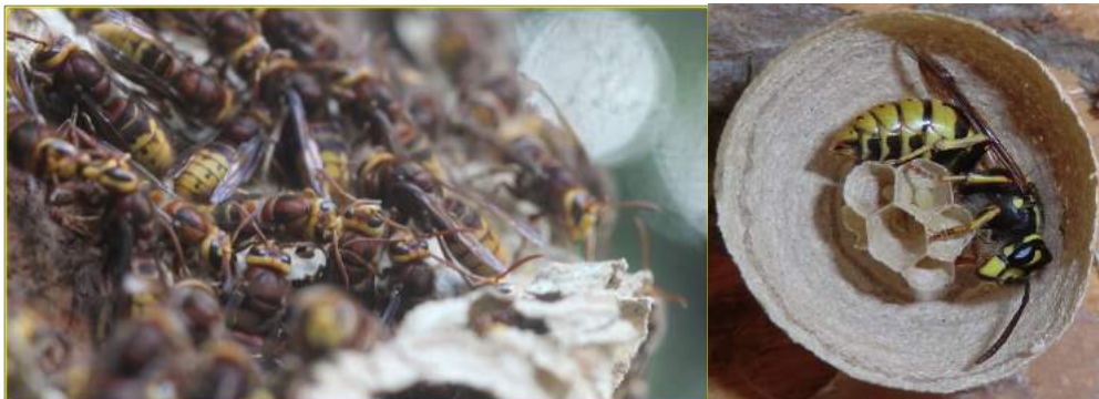
Wasps targetted by the Big Wasp Survey. Vespa crabro ; Vespula vulgaris

Unlike honeybees, social wasps are little studied, and the important ecosystem services they provide – as natural predators that regulate populations of other insects and arthropods – is largely unappreciated. The Big Wasp Survey asked members of the public to make a simple wasp trap, hang it in their garden for seven days, and then send in the trap contents to the scientists in order that the wasps could be identified.