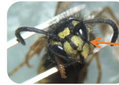
Rounded Face: Vespula

This is an invasive species - REPORT immediately if found!