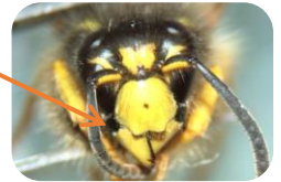
Elongated face: Dolichovespula